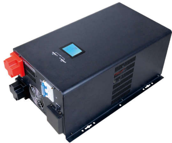
2500W ~ 3500W

The Pure Sine Wave Inverter is desirable long backup power solution for home and office appliances. It is not only an inverter but also contains a powerful intelligent charger. It provides pure sine wave power to all kinds of loads. And it can be used as UPS for computers as well.