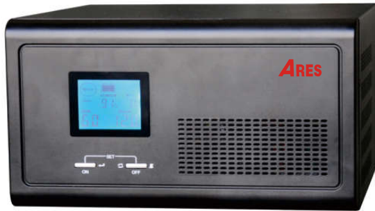
300W ~ 1600W